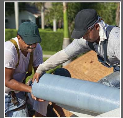
Shur-Gard MU Force HT Application