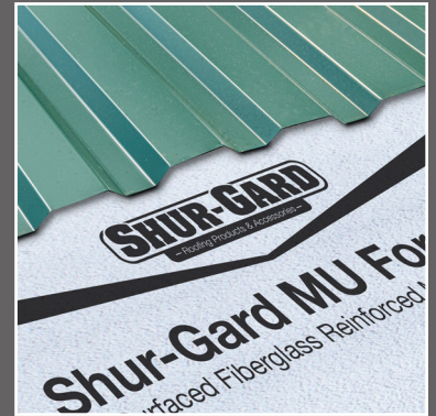
Shur-Gard MU Force HT Facer