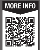
MU Ultra HT

The information herein should not be considered all-inclusive and should always be accompanied by a review of the Mule-Hide specifications and guidelines and good application practices.