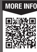
MU Force HT