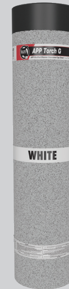
APP TORCH G