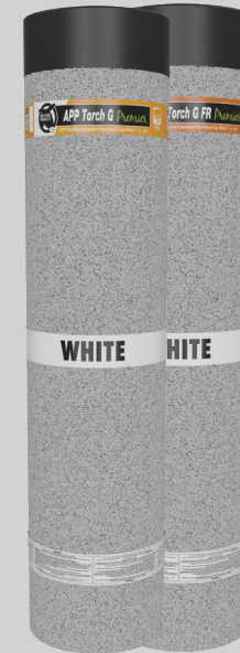
APP TORCH G, G FR PREMIER