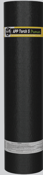
APP TORCH S PREMIER