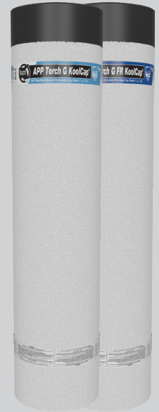
APP TORCH G, G FR KOOLCAP