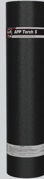
APP TORCH S