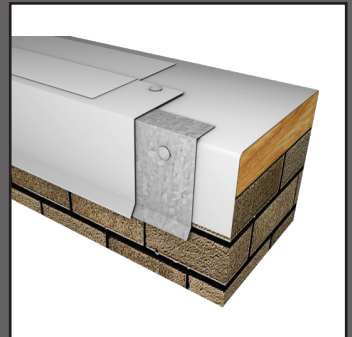
Drip Edge (PVC & TPO)

Contact your local territory manager to learn more.