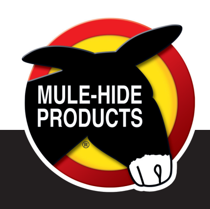
Rugged • Time-Tested • Weather-Tested

The Right Choice for Low-Slope Roofing Products 800-786-1492 • mulehide.com