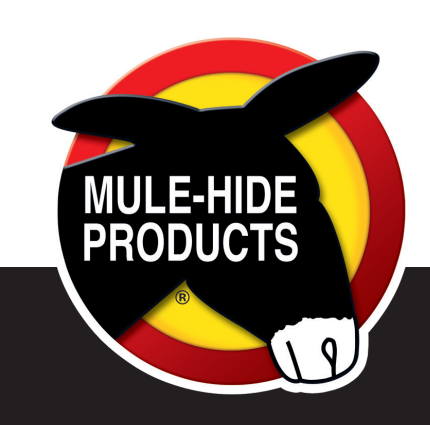
Rugged • Time-Tested • Weather-Tested

The Right Choice for Low-Slope Roofing Products 800-786-1492 • mulehide.com