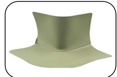
Colorway Outside Corner