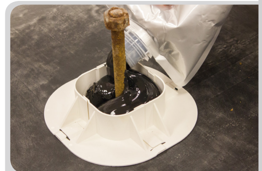
ShapeShift Corner/Straight with MP Liquid Sealant